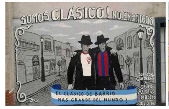
Figure 2 Evolution of the mural made by GAB and Corazón Quemero.

A first version of the mural, painted in 2014 depicted two fans who, while each wore his respective club shirt, resembled each other insofar as they also wore Buenos Aires' traditional clothing —with jacket and hat— and were set against an old street scene. The 'tradition' theme was stressed by using a black-and-white background showing a cobbled, lantern-lined street, with old-fashioned lettering and flourishes for the headline slogan. A second version of the mural, released in 2019, abandoned the traditional theme and joined the feminist agenda that had gained ground in recent years. For a sport traditionally linked to male honor (Alabarces, Garriga Zucal, & Moreira, 2008), the choice of two girls to represent the idea of "We are pals, not foes" remained fresh. The figures also gained prominence as they were much larger and the background also changed, with a colorful aesthetic depicting the neighborhood landscape found in both Boedo and Parque Patricios. Unfortunately, this mural was vandalized, suggesting social solidarity is still sorely needed (Figure 2).