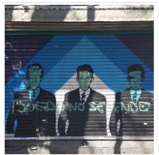
Figure 3 Graffiti on shop blinds in Boedo, painted by GCABA

the GAB were called on to participate. The response was not long in coming and, shortly after, these murals had uncomplimentary comments sprayed over them. However, it was not vandalism like the one in Figure 2, where the original message was obliterated. On the contrary, in this case the graffiti that "ruined" the blinds had very clear messages, among them "Boedo is not for sale", "To paint Boedo you have to give your life for Boedo", "Marketing pimps, get out of my neighborhood" (Figure 3).