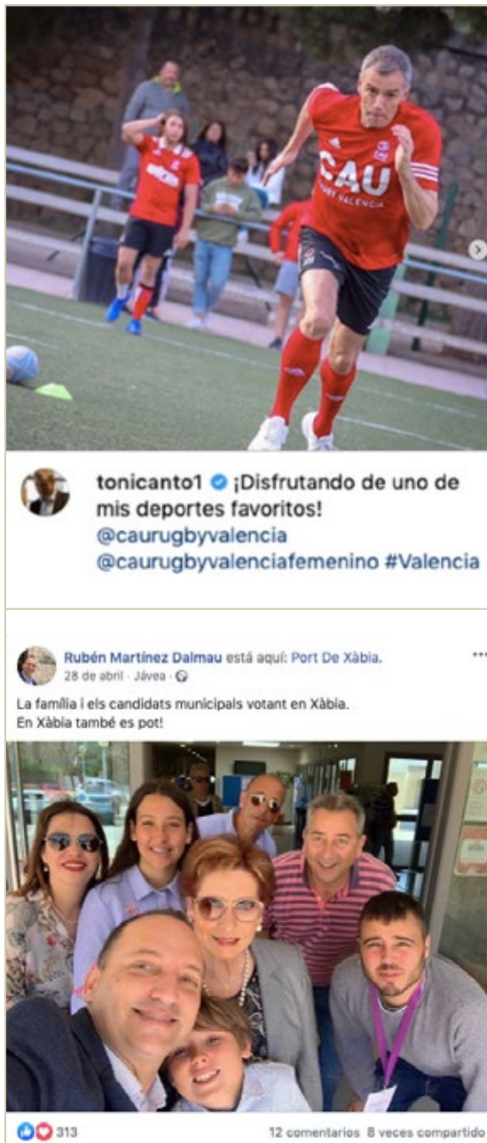
Figure 2 Examples of personal publications